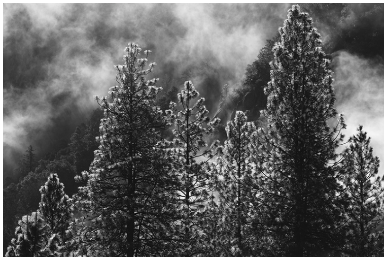
"Morning Light" ~ Flavio Parigi