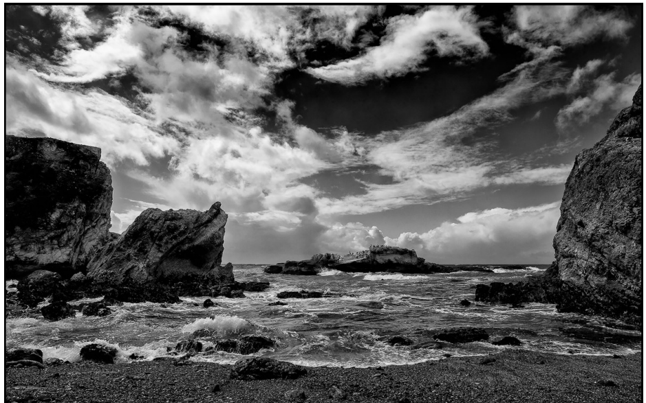
First Place-Monochrome Print—Large Back Shell Beach By Richard Russ