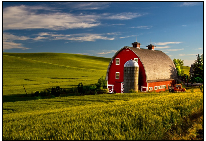
First Place—Color Print-Large Back Red Barn at Sunset By Lynda Snodgrass