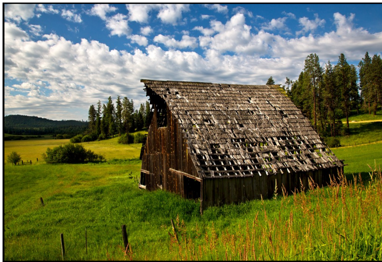
Second Place—Color Print-Large Back Last Barn Standing By Lynda Snodgrass