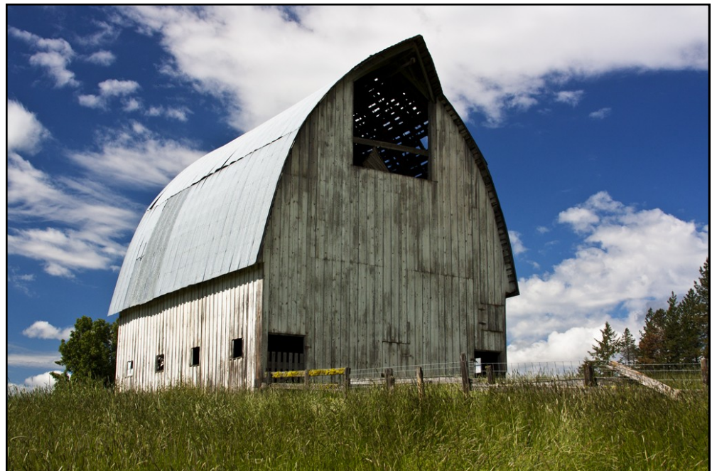
Second Place—Digital Cathedral Barn by Jim Snodgrass