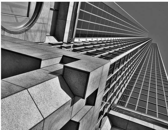
"LA Building" ~ Tom Wahweotten