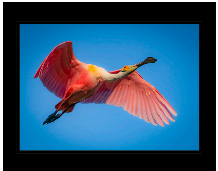
"Roseate Spoonbill" ~ Jeanne Sparks