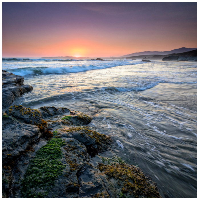
"Smokey San Simeon" ~ Janine Bognuda

Winning images from our July club competition (on this page and continued on pg. 5)