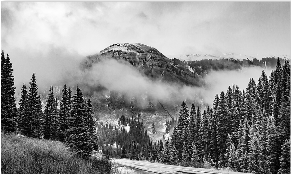
Winter's Arrival by Gregory Doudna (see page 4)