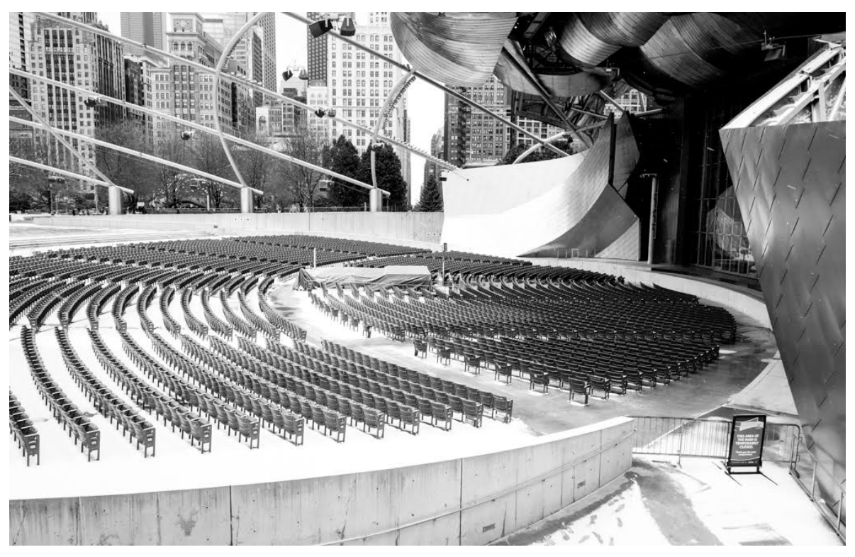
"Seasonal Closure" ~ Alan Upshaw