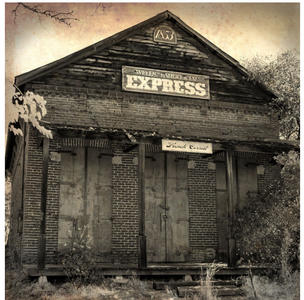
"French Corral Depot" ~ Cheryl Decker