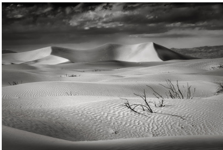
"Beckoning Dunes" ~ Elaine Calvert