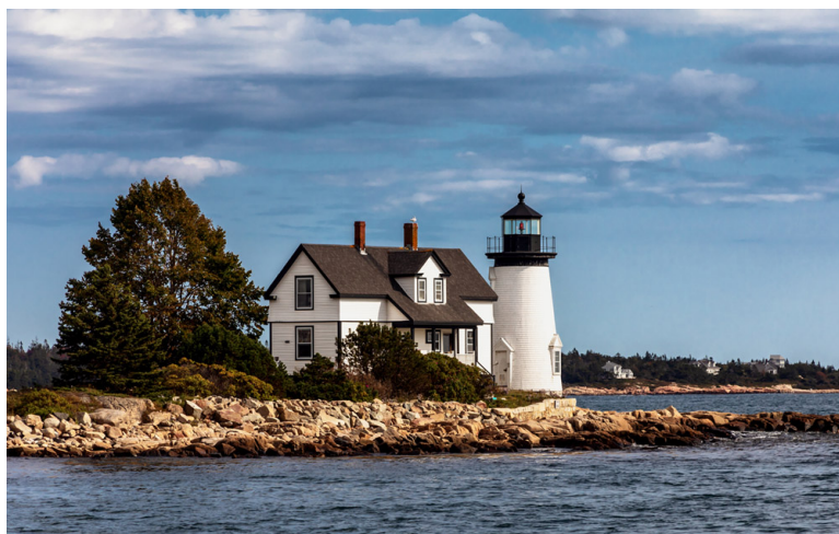
"Prospect Harbor Lighthouse" ~ Gregory Doudna