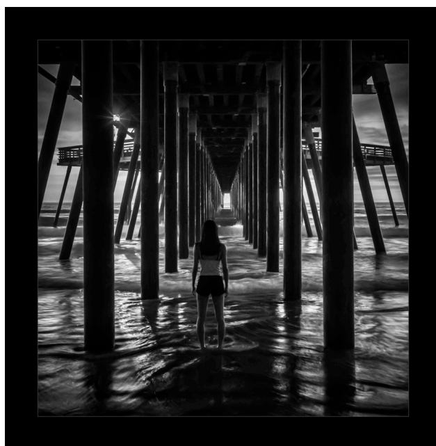
"Waves of Contemplation" ~ Janine Bognuda