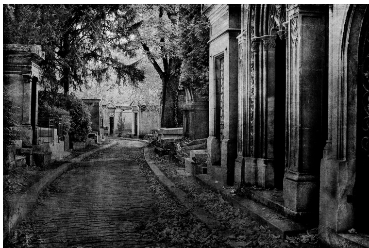
"Pere Lachaise Cemetery #3" ~ Jim McKinniss