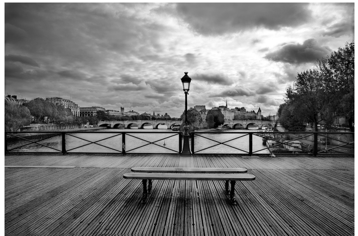
"View From Pont Des Arts #2" ~ Jim McKinniss