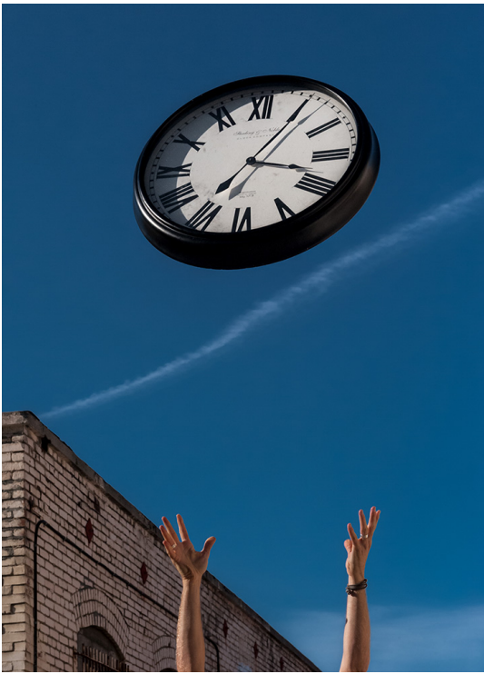
"Passing Time With Chris Orwig" Chuck Uebele