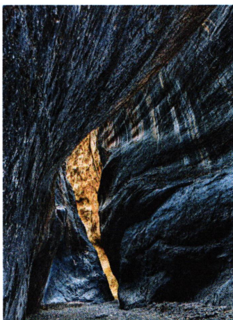
By Ed E Powell