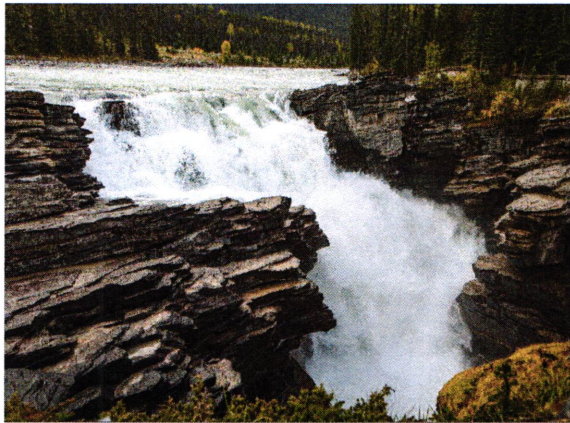
By Gregory Doudna