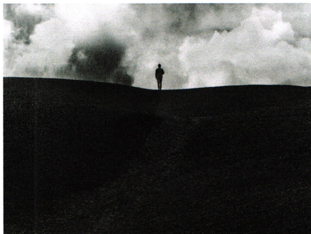
By Ed E Powell