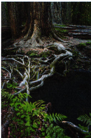
By Elaine Calvert