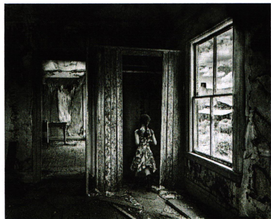
By Ed E Powell