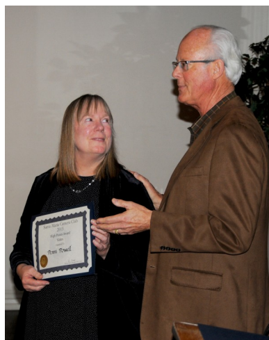
Hi Point Photographer Of the Year for Slides