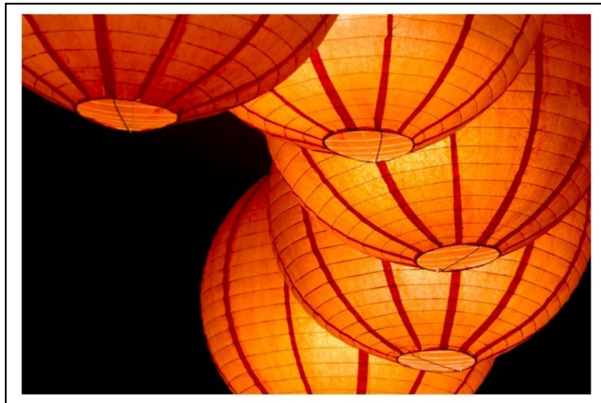
LARGE PRINT COLOR 3rd: Ramona Cashmore Chinese Lanterns