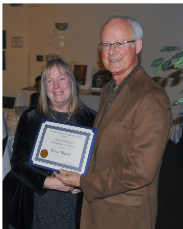
Hi Point Photographer Of the Year