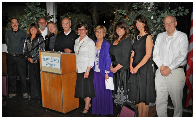
Complete Board with Committee Chairs