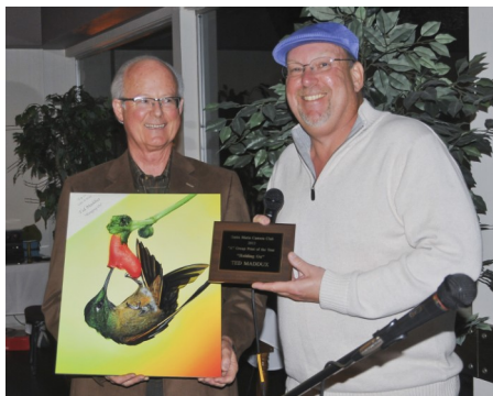
Print of the Year For Color A