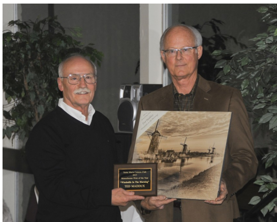
Print of the Year For Monochrome