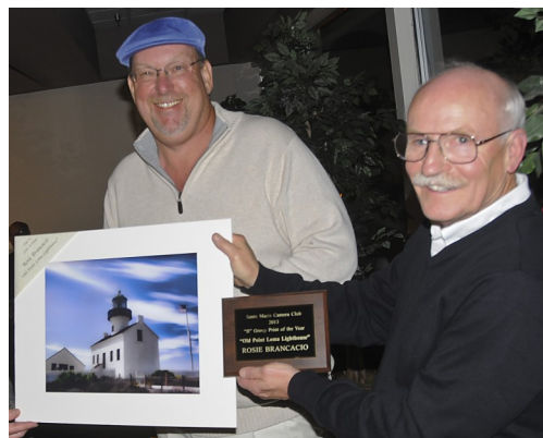
Print of the Year for Color B