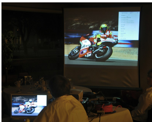
Digital Image of the Year