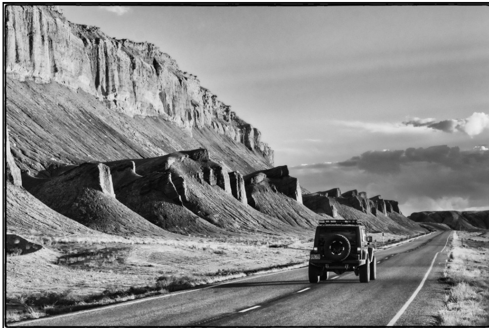
Monochrome - 3rd: Ron Calvert - Hitting the Open Road