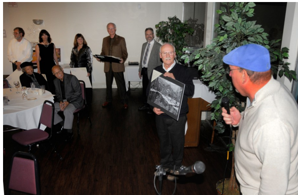
The Judge explaining