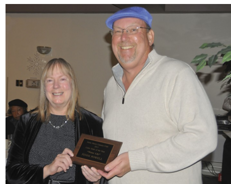
Slide of the Year