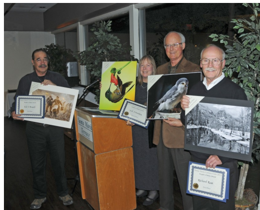
Peoples Choice Awards