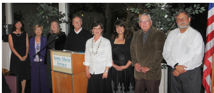
Executive Board with Elected Board