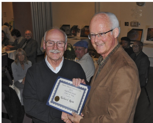
Hi Point Photographer Of the Year for Color A