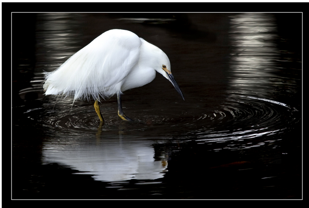
Nyla James 1st place digital image "Fishing for Breakfast" from the January 2015 Competition