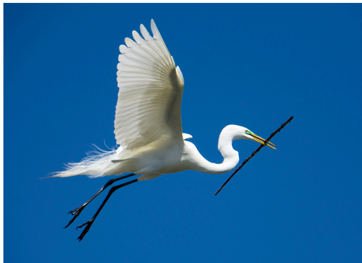
"Graceful Beauty" ~ Jeanne Sparks