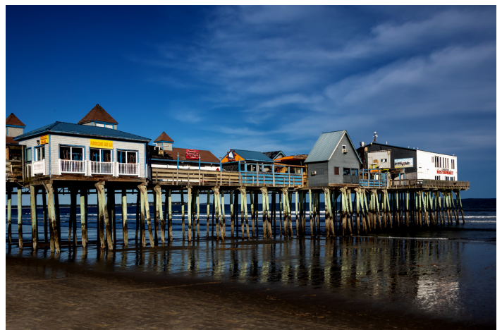
"Pier at Old Orchard Beach" ~ 3rd in Small Prints