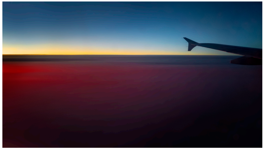
"Sunrise at 38,000 Feet" ~ Chuck Ubele