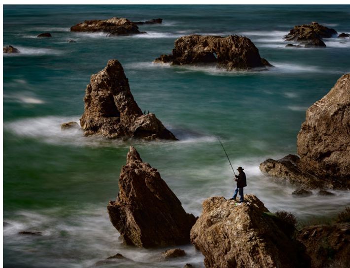
"Gone Fishing" ~ Chuck Ubele