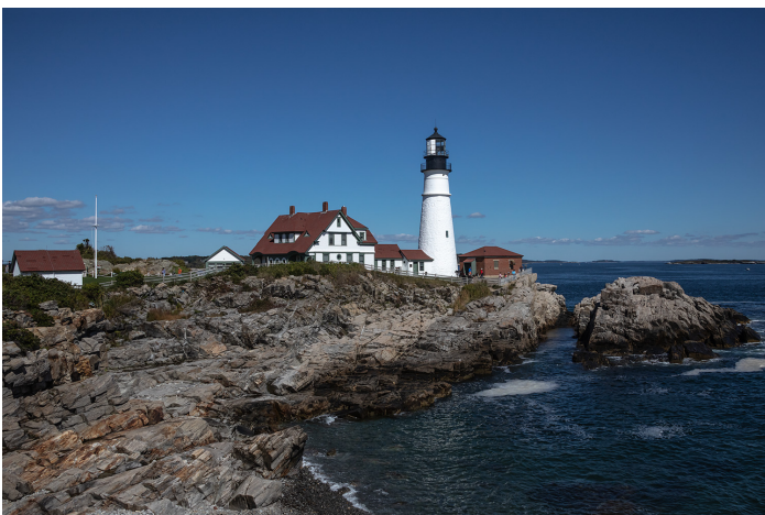
"Portland Head Lighthouse" ~ 1st in Small Prints