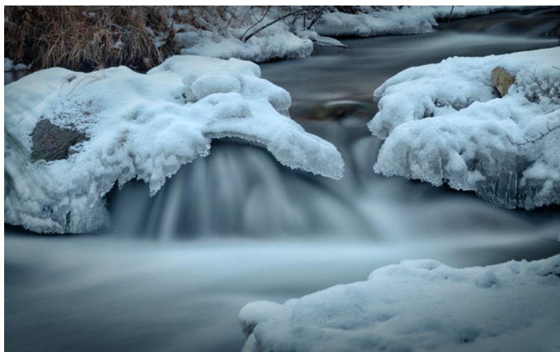
“River Ice” ~ Elaine Calvert