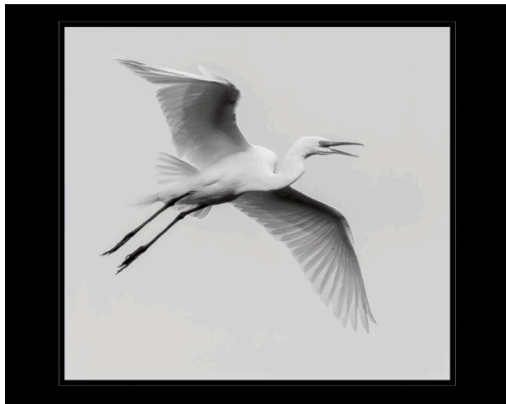
"Graceful Flight" ~ Jeanne Sparks