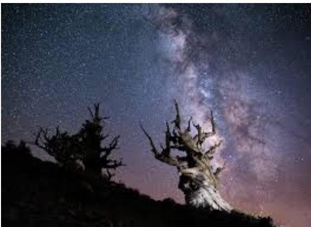
Bristlecone and Milky Way (Hwy 395)