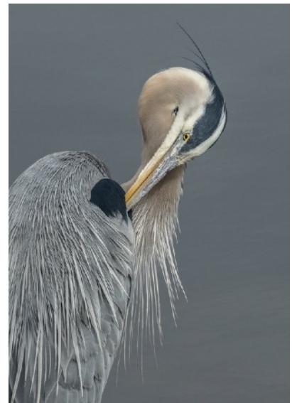
"Great Blue Heron" ~ Elaine Calvert