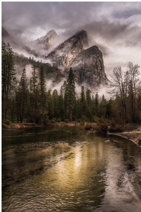
"The Brothers" ~ Elaine Calvert