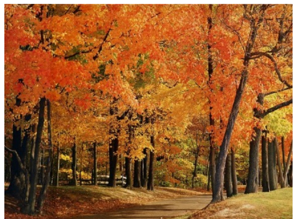
Fall Color in the Western Sierras