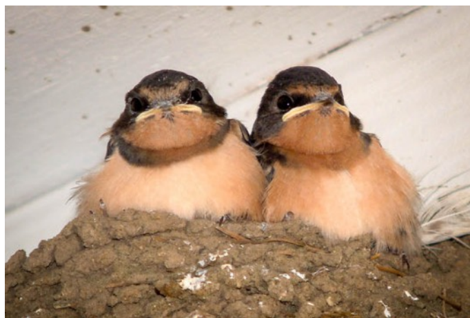
"Waiting For Mom" ~ Chuck Ubele