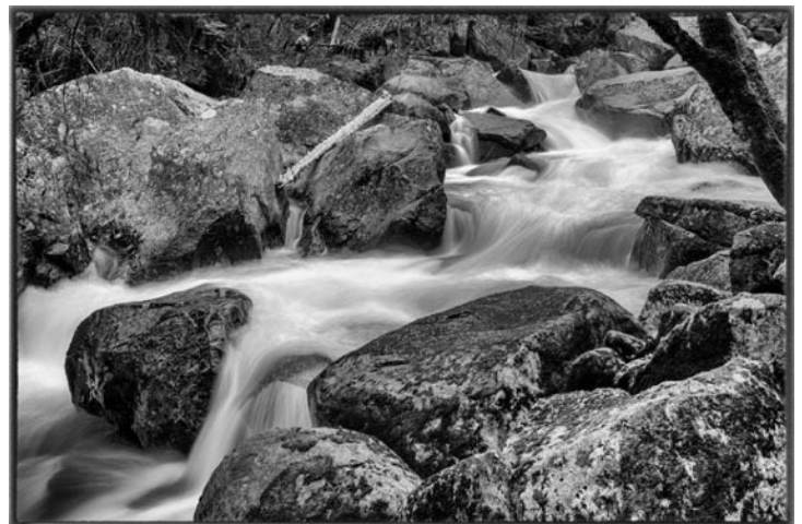
"Spring Runoff" ~ Gregory Doudna