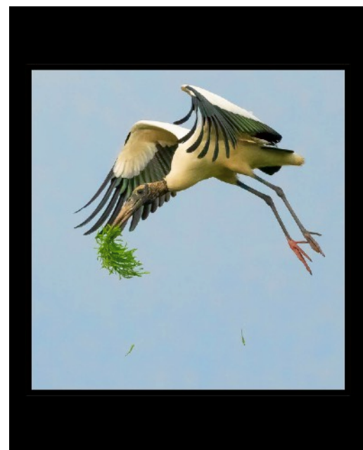
"Building a Green Home" ~ Jeanne Sparks