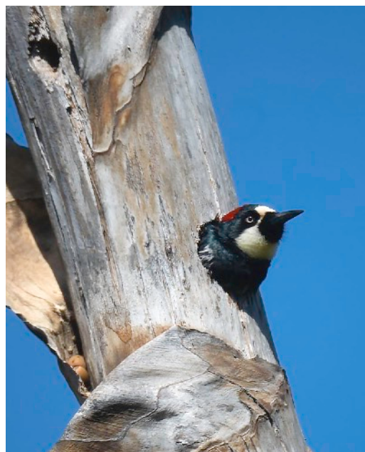
"Woodpecker in a Century Plant" ~ Cheryl Decker