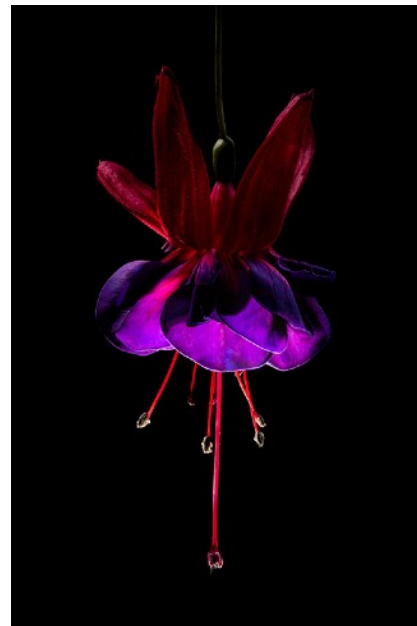
"Voodoo" ~ Chuck Ubele