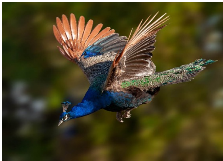
"Peacock" ~ Chuck Ubele