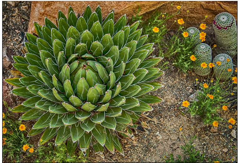
"Desert Spiral" by Gregory Doudna