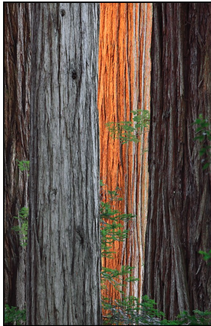
Digital 2nd Place: Redwood & Re- flected Light by Ed Powell