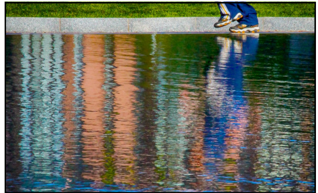
Digital 3rd Place: Skipping Reflections by Nyla James