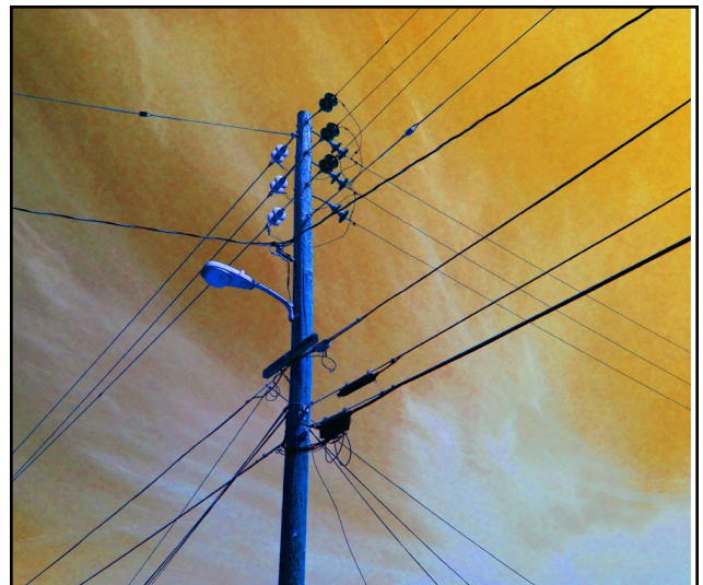
Digital HM: Light up the Sky by Flavio Parigi