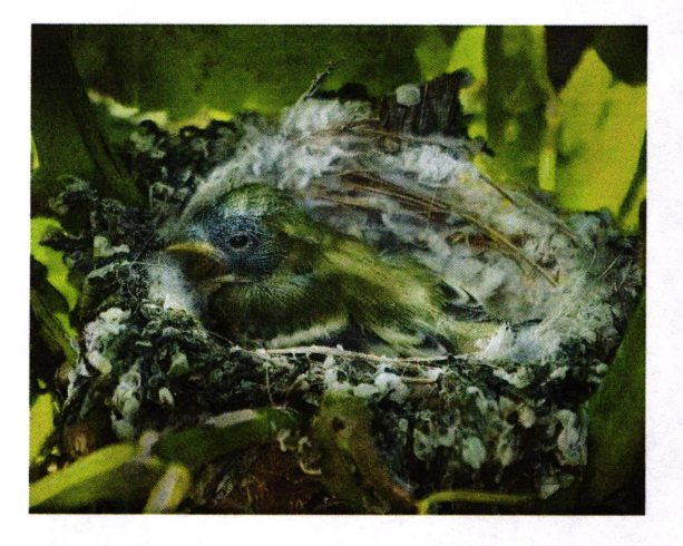
By Cherry Decker