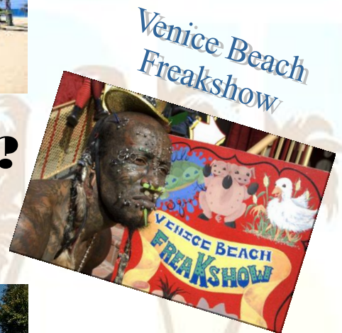
Venice Beach Freakshow

Contact info for Rosie Brancacio Cell# 909-838-8022