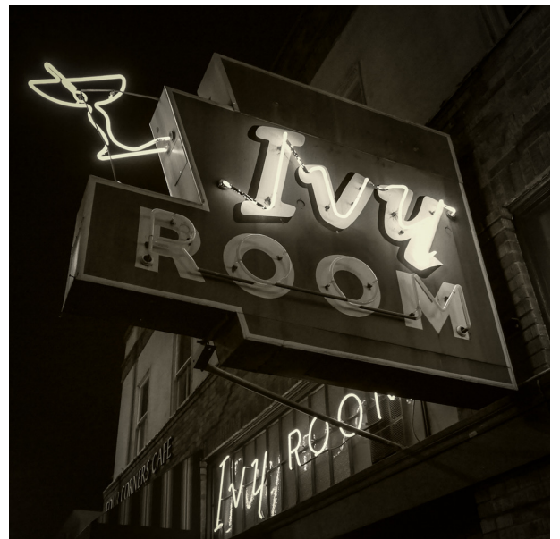
"The Ivy Room" ~ Alan Upshaw