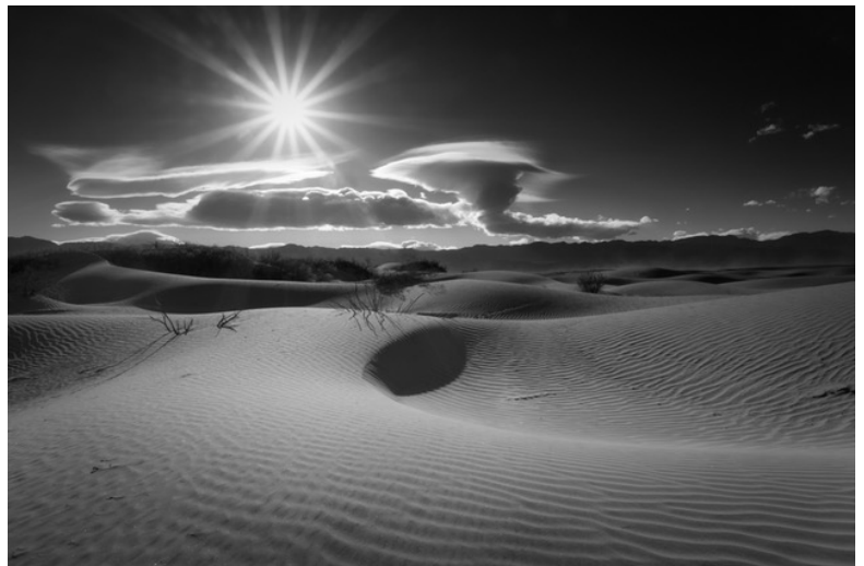
"Desert Sun" ~ Elaine Calvert