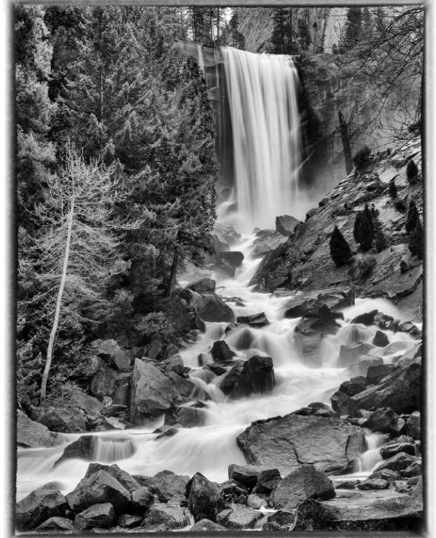
"Vernal Falls at 1 Second" ~ Gregory Doudna