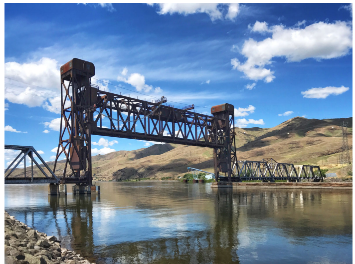
"Lift Bridge on the Snake River" ~ Ramona Cashmore