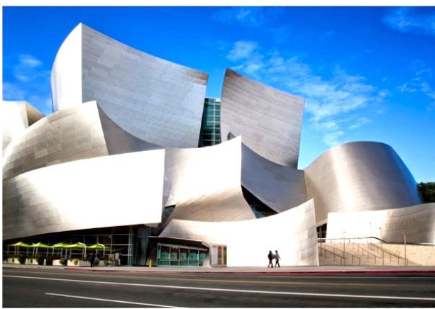
Symphonic Art Ramona Cashmore