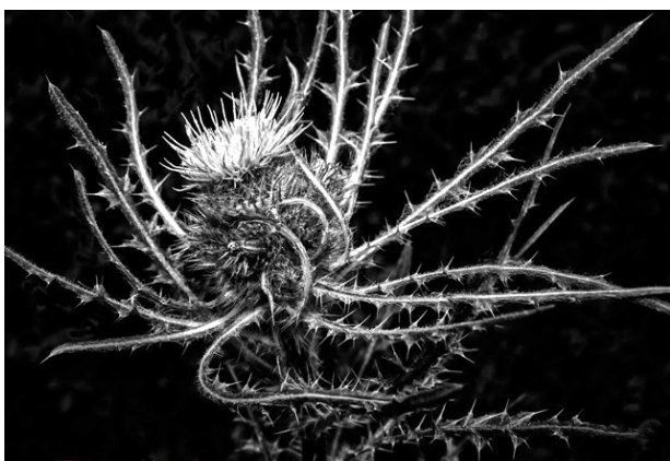
Wild and Woolly Thistle Elaine Calvert