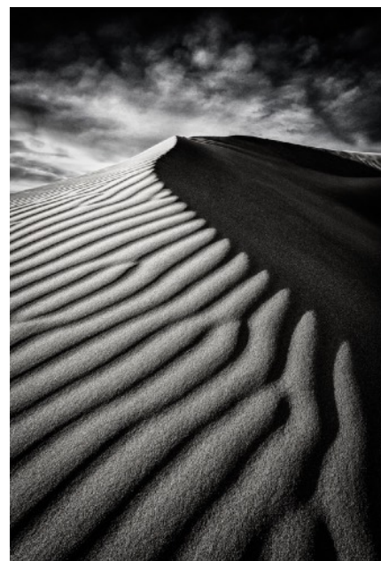
Janine Bognuda "Moody Dunes"