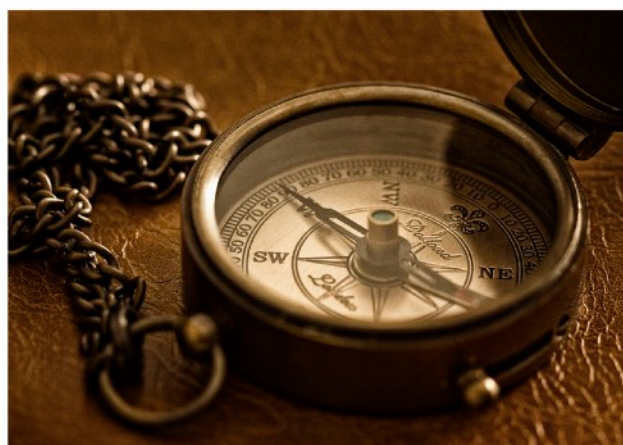
Ramona Cashmore "Travel Companion"