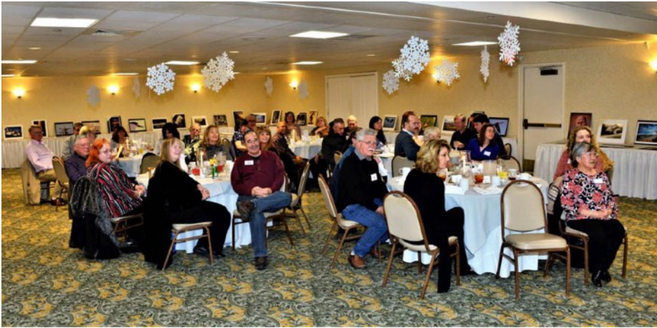
Scenes and displays in the banquet room of the Santa Maria Inn.