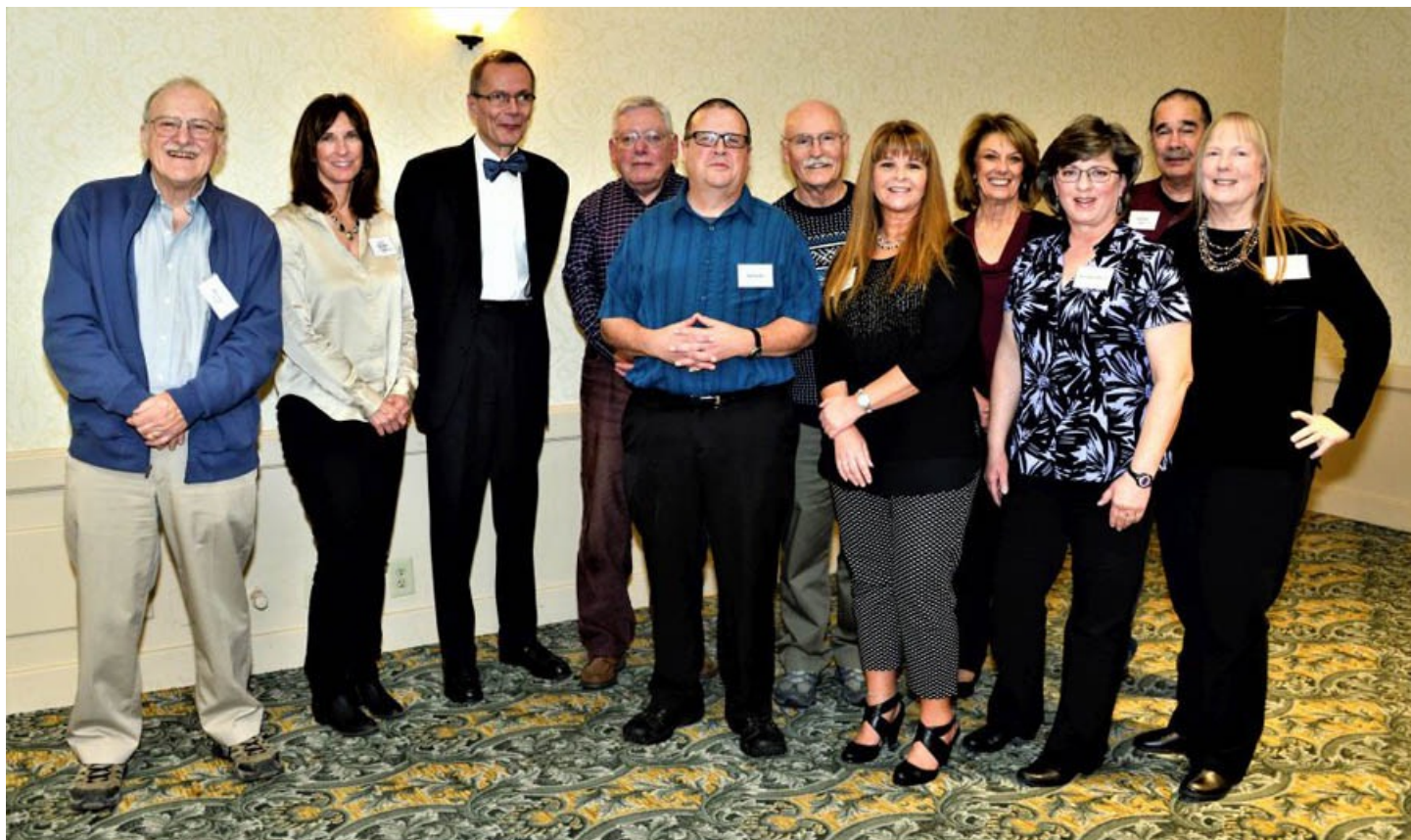
2017 Officers and Board (L to R):