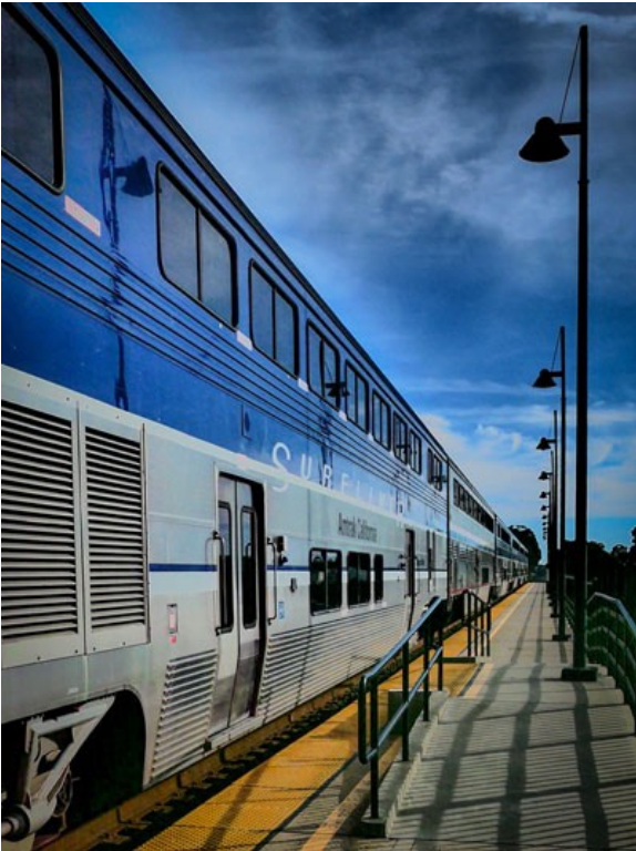
Grover Station ~ Alan Upshaw