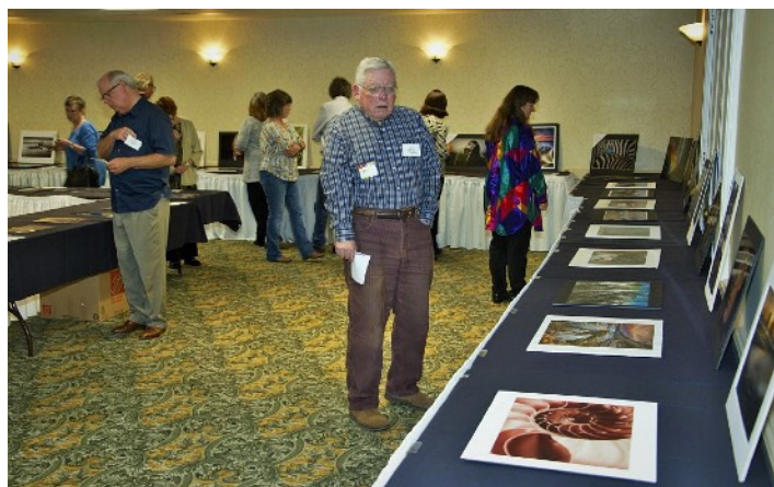
Members voting for People's Choice awards.