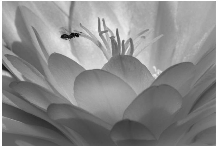
Fly By ~ Elaine Calvert