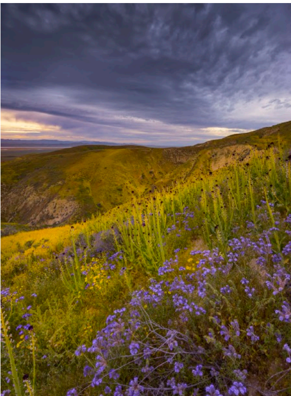
Storm Arrives on the Carrizo