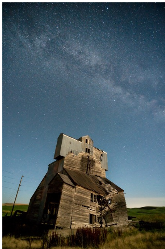
Under the Stars in Palouse ~ Elaine Calvert