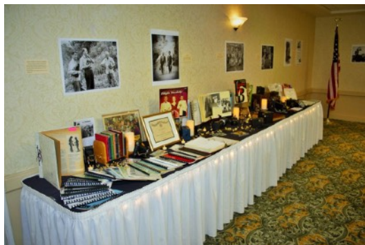
Memorabilia representing the 1930's - 40's