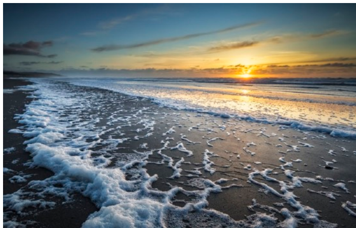
Sea Foam Sunset ~ Janine Bognuda