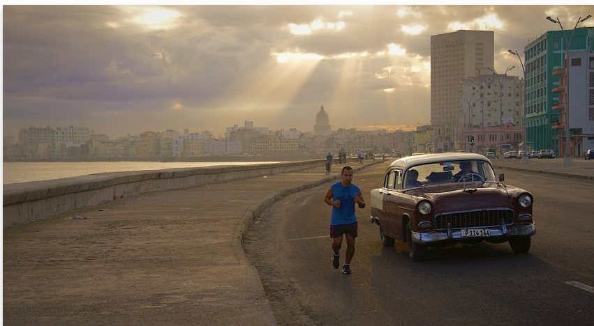
A Cuban Early Morning Run by Tom Wahweotten More winning images from the April Competition on pages 3 & 5.