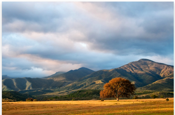
Cottonwood Canyon by Tom Wahweotten