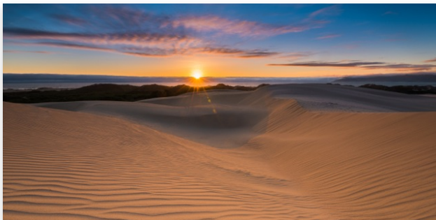
Simply Sunset