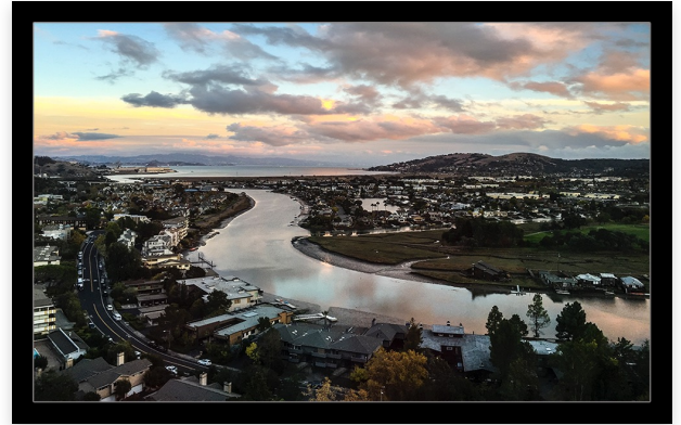
View From the Tamalpais by Jeanne Sparks