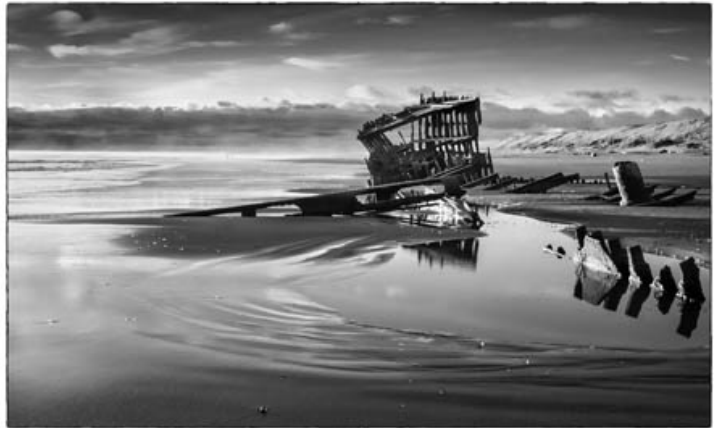
"The Skeletal Remains of the Peter Iredale" by Elaine Calvert