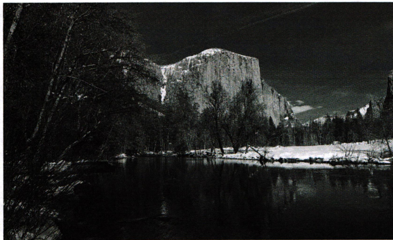
By Flavio Parigi