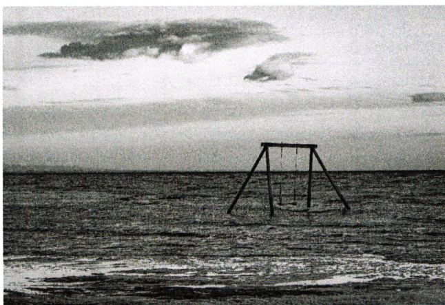
By Penny Powell