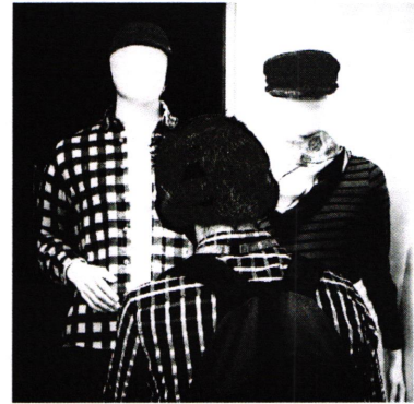
By Cheryl Decker