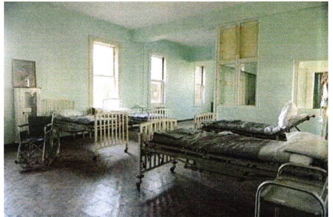
Preston Castle in Lone, CA

Get ready to frame history through your lens and create images that will leave an impression. Calling all photographers and lovers of breathtaking landscapes! Join us for a captivating day of artistic exploration during our Photographers Day Event Tour at Preston Castle. This exclusive opportunity allows shutterbugs of all skill levels to capture the timeless beauty of this historic treasure. As the sun casts its gentle rays upon the castle's majestic façade, you will have unrestricted access to its unique architectural details, captivating textures, and picturesque surroundings. Whether you are drawn to the play of light and shadow or the hidden stories within each corner, this event is a photographer's dream come true. So, grab your camera, unleash your creativity, and join us for a day filled with inspired moments and unforgettable captures at Preston Castle.