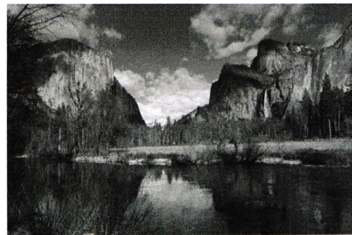
By Flavio Parigi