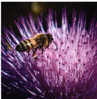
By Cheryl Decker