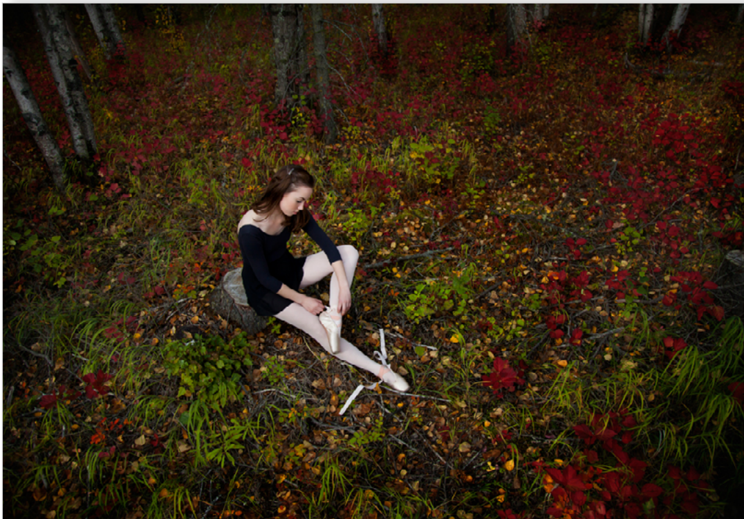
Babe in the Woods by Nyla James (see page 4)