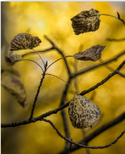
The Last to Fall by Elaine Calvert