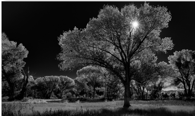
Yellow = Grey by Richard Russ (see page 4)