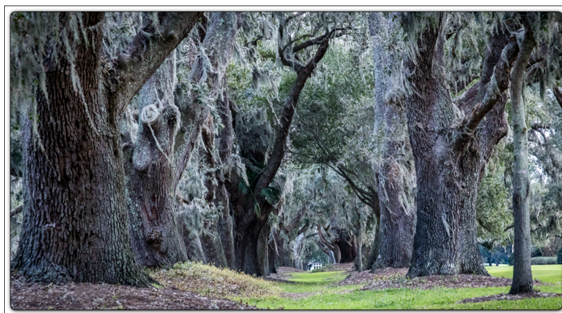
"Oak Pathway" ~ Gregory Doudna