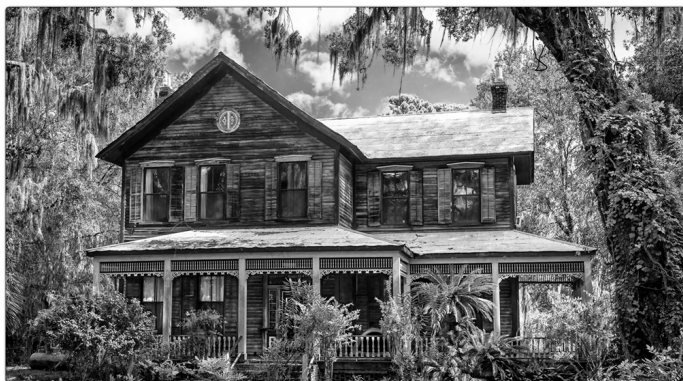
"Fading Beauty" ~ Gregory Doudna