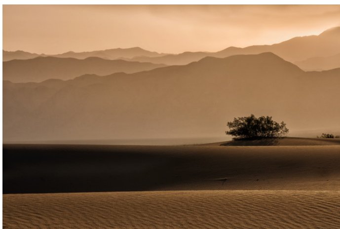
"Little Bush in the Dunes" ~ Elaine Calvert