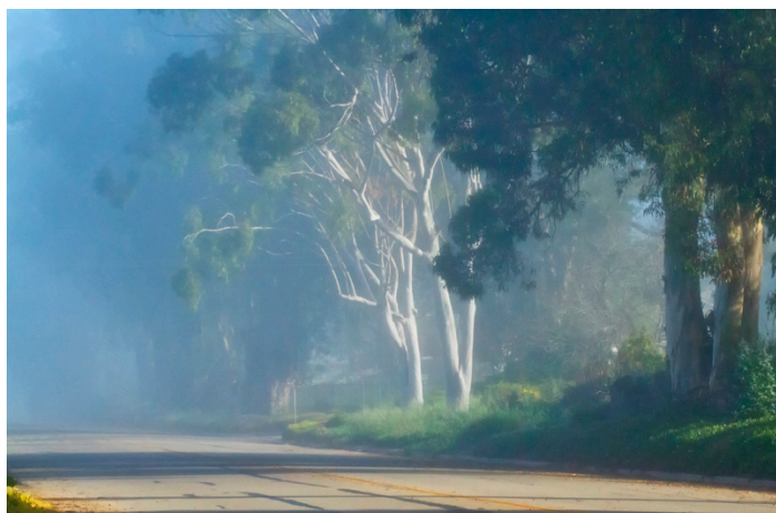
"Fog on a Tree-Lined Street" ~ Ramona Cashmore