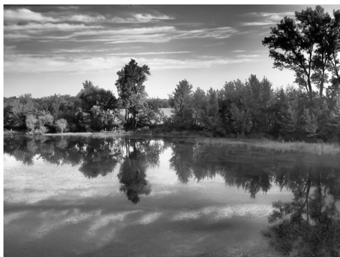
"Pond" ~ Alan Upshaw