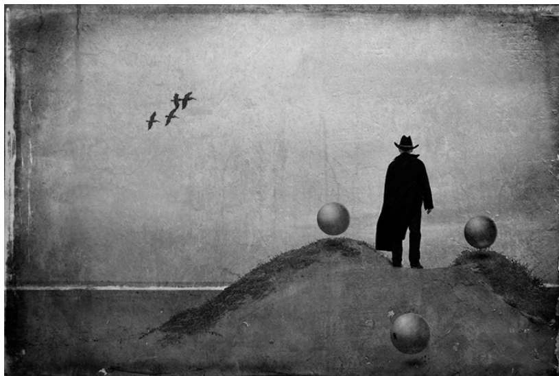
"Man in Black on Dune"