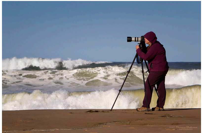
by Ramona Cashmore

If you have any ideas to share concerning our Club, please reach out to one of the following: