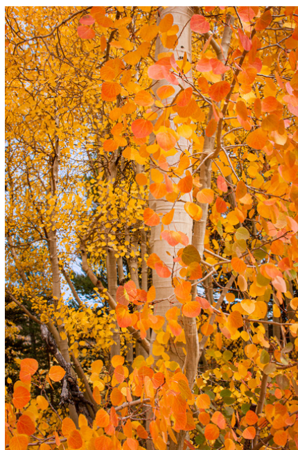
“The Color of Aspen” by Elaine Calvert