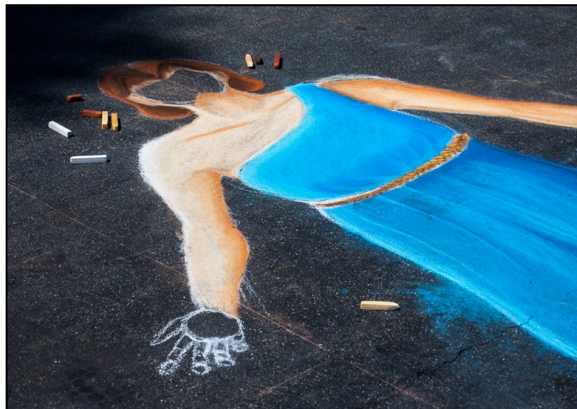
Digital- Third Place Not Quite Finished by Penni Powell