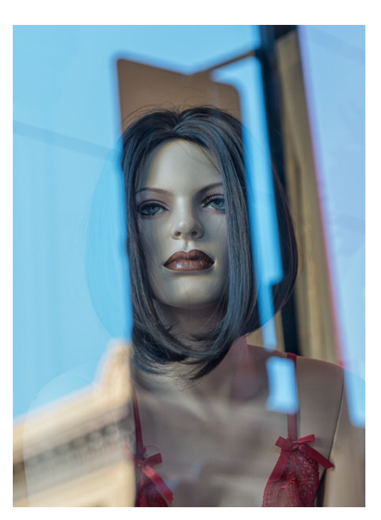
"A Mannequin's Window Prison" Elaine Calvert