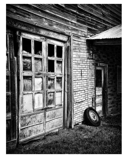
"Old Garage" ~ Ramona Cashmore