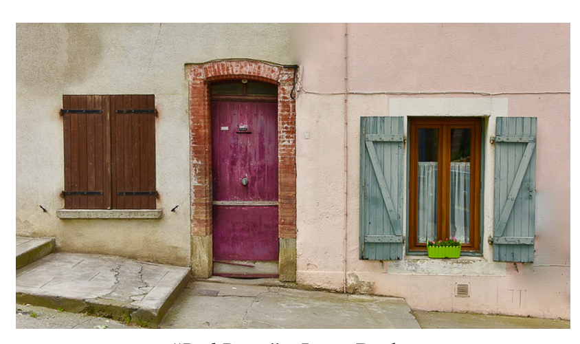
"Red Door" ~ Larry Decker