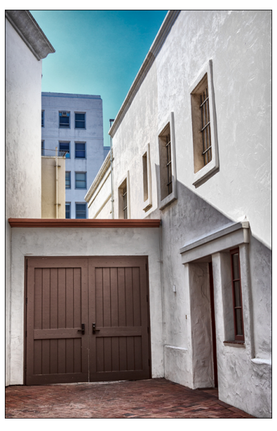
"Service Entrance" Gregory Doudna