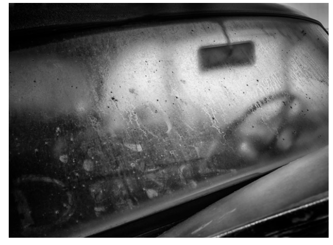
"Roadside Spectacle" ~ Elaine Calvert