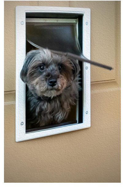
"Looking Out" Jeanne Sparks