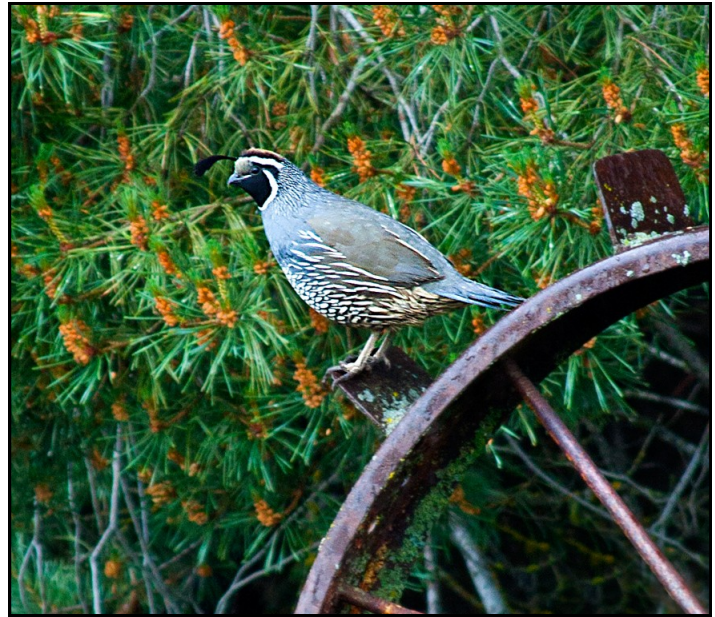
Digital 2nd Place: Junk Yard Quail By Jim Snodgrass