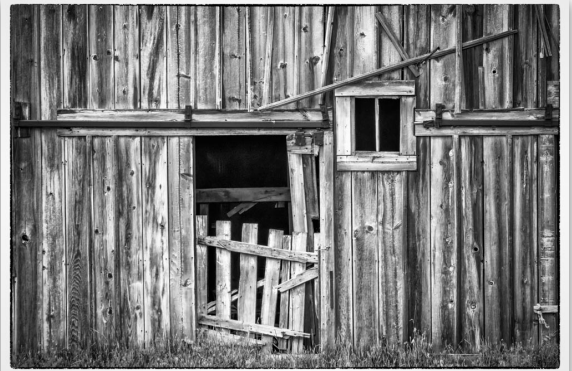
Barn with Gated Entry by Elaine Calvert