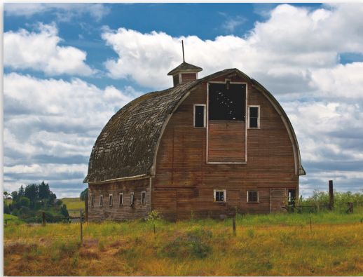
Hay Barn by Lynda Snodgrass