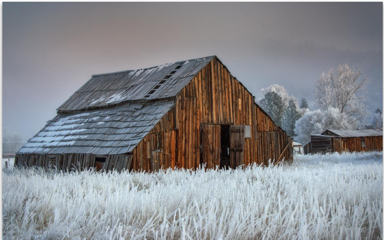
Winter Barn by Elaine Calvert (see pages 4 & 5 for more photos and August Competition results)