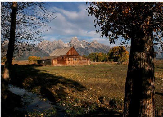
Mormon Row