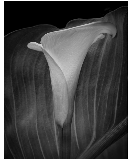
"Calla Lily" ~ Elaine Calvert