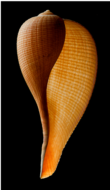
"Shell" ~ Chuck Uebele