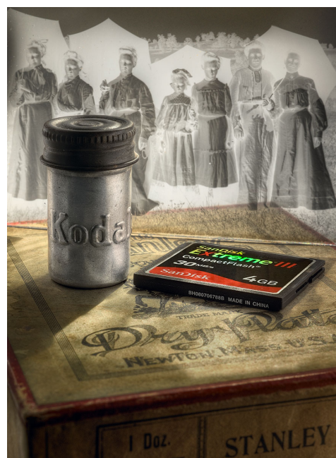
"Then and Now" ~ Chuck Uebele