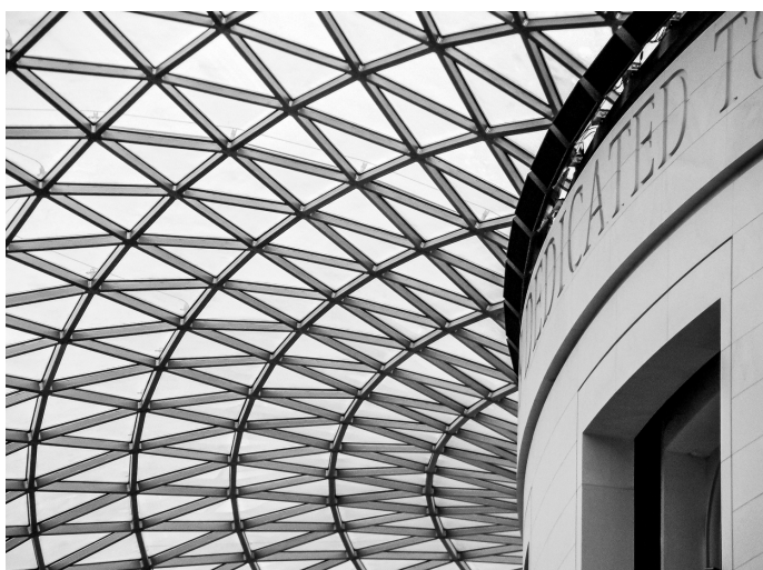
"British Museum"