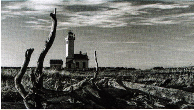
By Ed E Powell