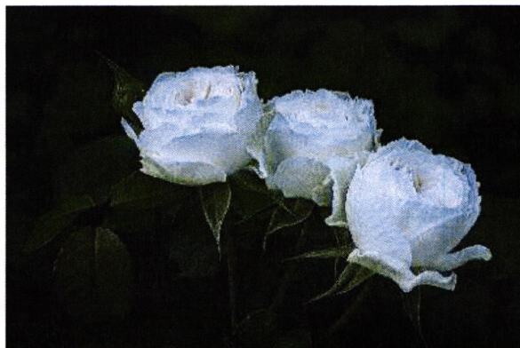
By Ed E Powell